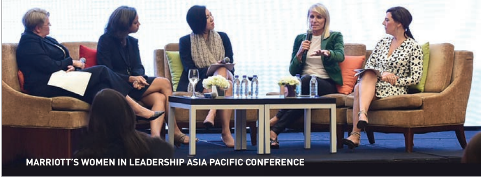
MARRIOTT'S WOMEN IN LEADERSHIP ASIA PACIFIC CONFERENCE