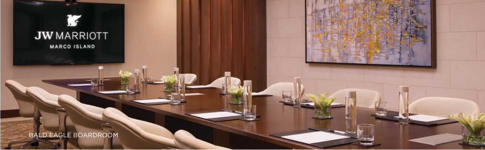
BALD EAGLE BOARDROOM