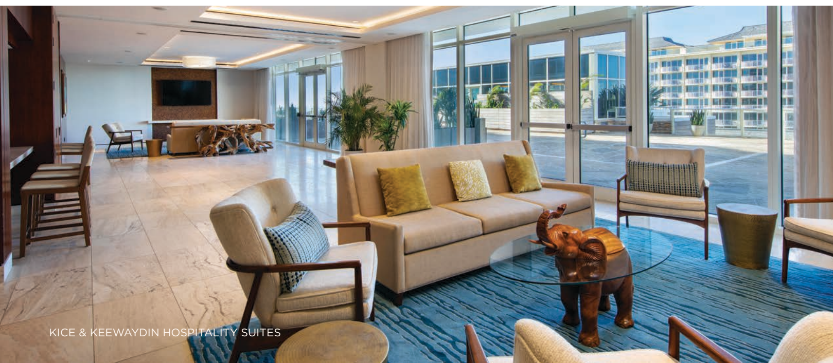
KICE & KEEWAYDIN HOSPITALITY SUITES