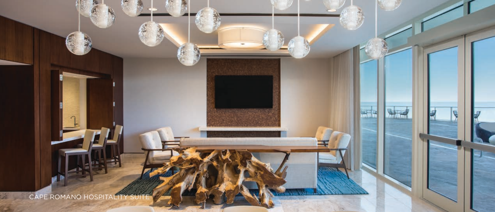
CAPE ROMANO HOSPITALITY SUITE