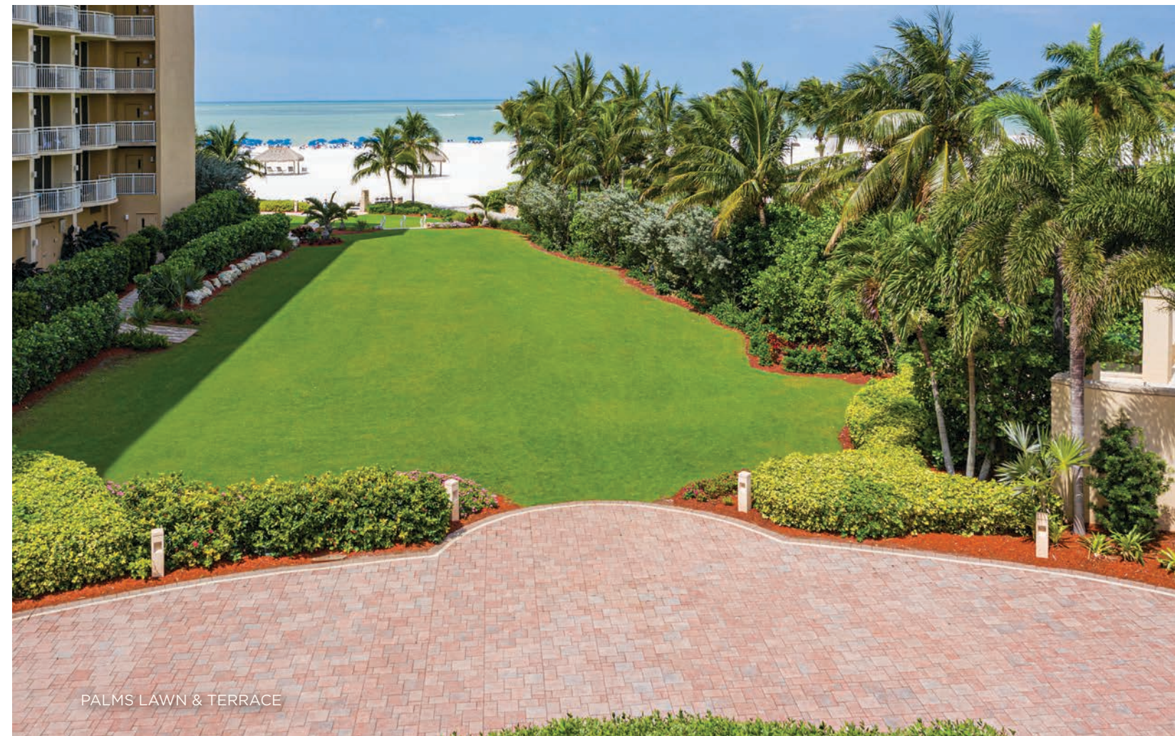
PALMS LAWN & TERRACE