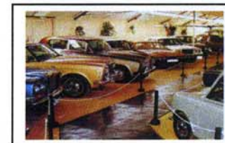
Transport treasures at Stondon

Stondon Transport Museum (Lower Stondon) - this is the largest private collection of bygone vehicles in England, from the start of the last century up to modern day classics (around 300 exhibits). Cars, motorbikes and aircraft, even a full size replica of Captain Cook's ship 'Endeavour'.