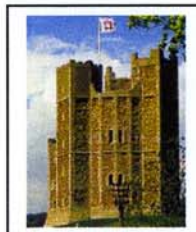
Climb the castle at Orford