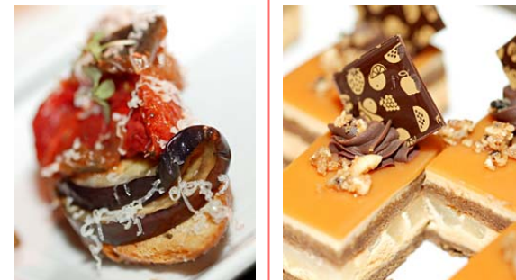
Table Side Desserts | $15