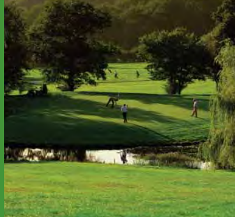
MARRIOTT MEON VALLEY HOTEL & COUNTRY CLUB, SOUTHAMPTON/WINCHESTER