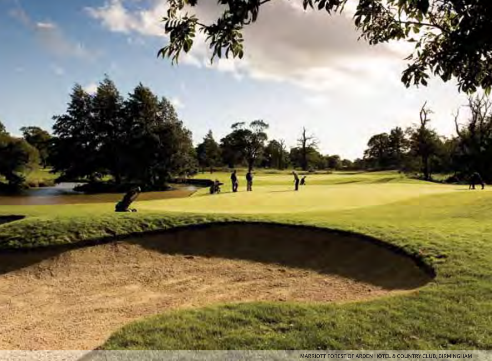
MARRIOTT FOREST OF ARDEN HOTEL & COUNTRY CLUB, BIRMINGHAM