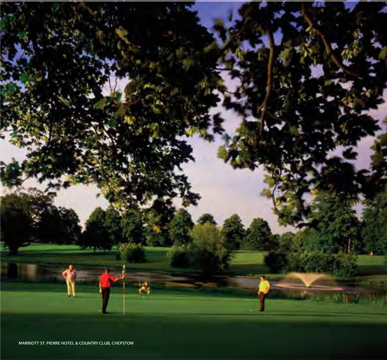
MARRIOTT ST. PIERRE HOTEL & COUNTRY CLUB, CHEPSTOW