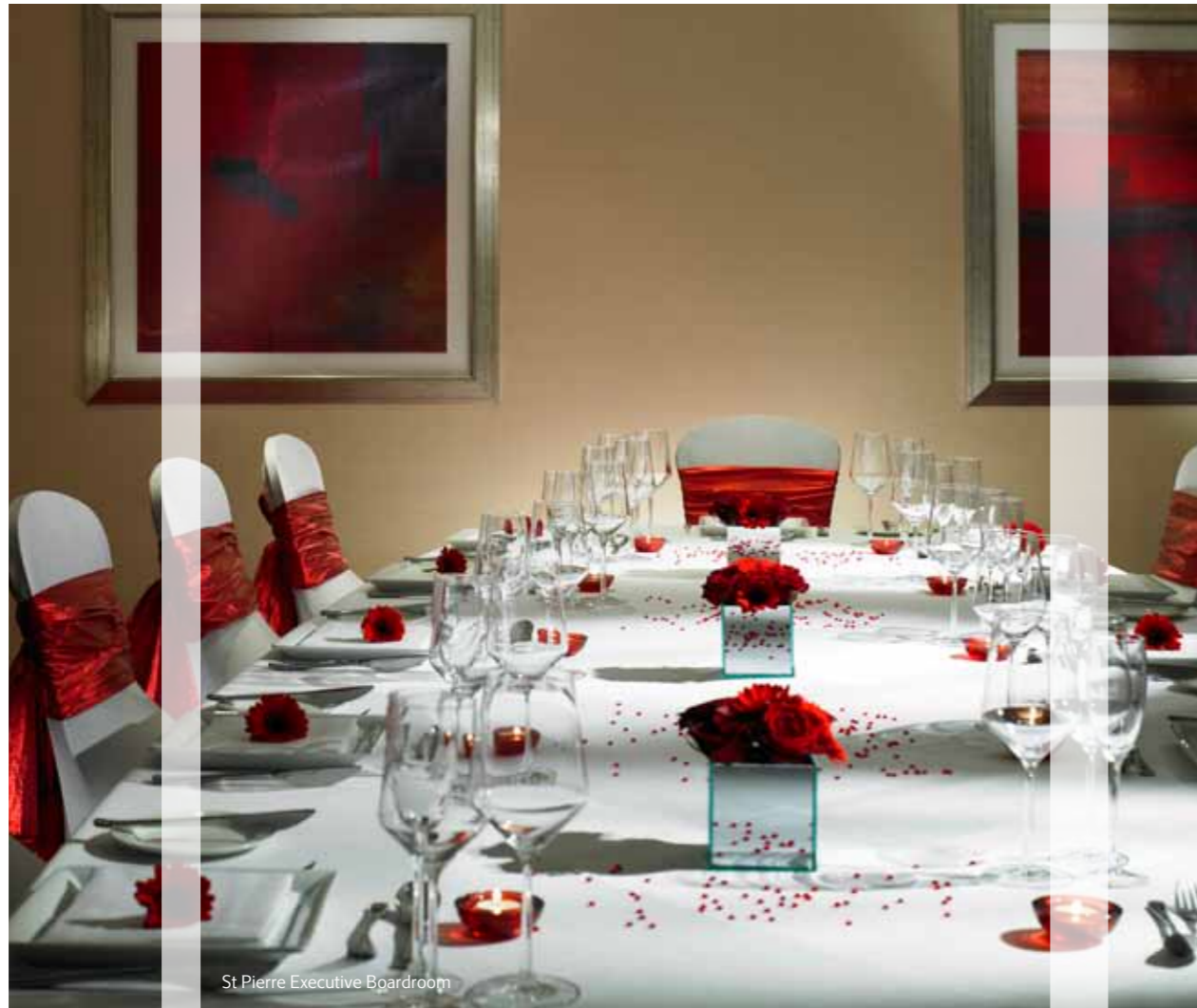
St Pierre Executive Boardroom

I do not expect you to fulfil all my dreams, only to share them, and allow me to share yours.