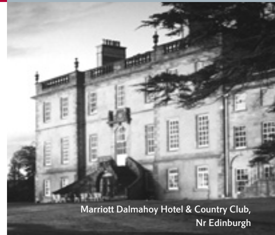
Marriott Dalmahoy Hotel & Country Club, Nr Edinburgh

Y our honeymoon is the idyllic start to your new life together. Continue the fairytale of the perfect day with the perfect honeymoon at any of our 2,800 hotels worldwide, including a choice of over 70 hotels across the UK and Ireland.