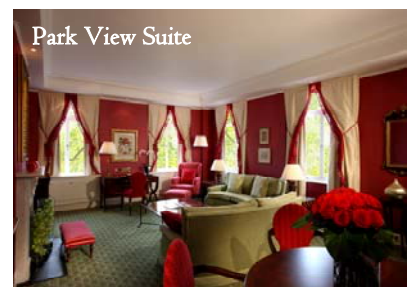
Park View Suite