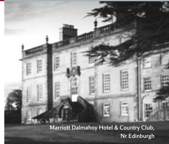
Marriott Dalmahoy Hotel & Country Club, Nr Edinburgh

Y our honeymoon is the idyllic start to your new life together. Continue the fairytale of the perfect day with the perfect honeymoon at any of our 2,800 hotels worldwide, including a choice of over 70 hotels across the UK and Ireland.