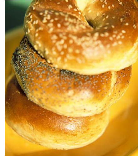
Pricing Based on 1.5 hours of Service

24% taxable service charge and applicable state sales tax will be added to all food and beverage.