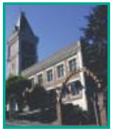
Historic Ghirardelli Square—more than just delicious chocolate!

✦ Ghirardelli Chocolate Factory The collection of circa 1860 buildings that housed the original chocolate business now features an international collection of over 50 remarkable restaurants, galleries and specialty shops, breathtaking bay views and beautifully landscaped plazas. The building survived the Great 1906 earthquake!