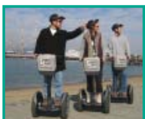
Tour the waterfront on a guided Segway tour.

✦ Mark Twain once observed, "The coldest winter ever spent was a summer in San Francisco." Our Mediterranean Climate makes August and September our