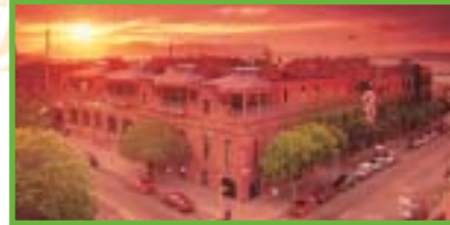
Sunset at The Cannery at Del Monte Square, once the world's largest peach cannery.

✦ The Cannery at Del Monte Square , the factory where they once canned Del Monte peaches is now a thriving marketplace. Spend a few hours in the delightful courtyard surrounded by shops and restaurants in an historic brick building.