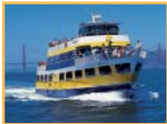
Aboard Blue and Gold Fleet Sail to Alcatraz or cruise the bay.

✦ Sixteen rivers empty into San Francisco Bay , which is actually an estuary (a mix of salt and fresh water). As northwesterly winds blow in off the Pacific coast and whip up the California current, colder, deeper water mixes with the warm air on the surface. The result? Frothy fog rolls in off the Pacific like a magical floating blanket. Higher summer temperatures draw the fog inland and over the Bay.