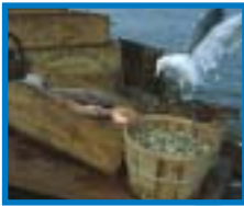
Salmon Capital of the West Coast—80% of all Salmon caught by sports fishermen comes from Northern California waters.

✦ Watch the fishing fleet come in along Jefferson Street. Over 300 boats call Fisherman's Wharf home. Pier 45 is the largest seafood processing area on the West Coast. San Francisco knows fish!