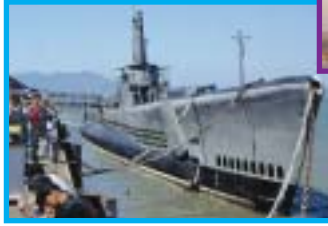
USS Pampanito is a WWII treasure at Pier 45, Fisherman's Wharf.

Square Rigged Balclutha at San Francisco Maritime National Historical Park.