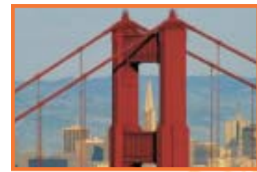
The International Orange tower of the Golden Gate Bridge can be seen from the Wharf waterfront.

Meet a starfish at the Aquarium's "Touch Pool."