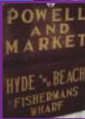
Cable cars replaced horses in 1869. It's all been uphill ever since.

Look for Cable Cars with this sign to get to Fisherman's Wharf.