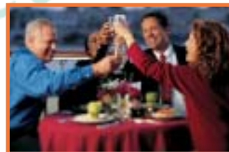
Enjoy dining aboard a Hornblower Cruise.

✦ Watch the fishing fleet come in along Jefferson Street. Over 300 boats call Fisherman's Wharf home. Pier 45 is the largest seafood processing area on the West Coast. San Francisco knows fish!