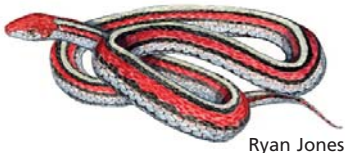
Endangered San Francisco garter snake.

At least two rare species—the endangered San Francisco garter snake and the threatened red-legged frog—find protection in Mori Point's native coastal prairie vegetation. Wildlife at Mori Point, especially its endangered species, rely on the efforts of volunteers to ensure