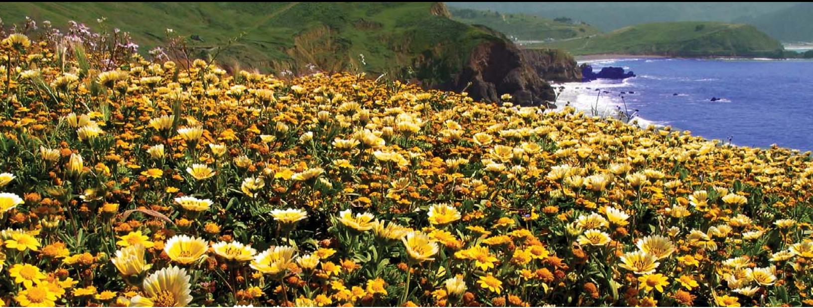
Spring wildflowers, like these tidytips and goldfields, carpet Mori Point.