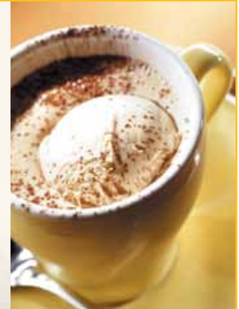
terms and conditions