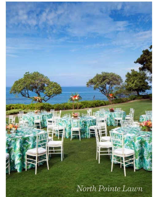
North Pointe Lawn