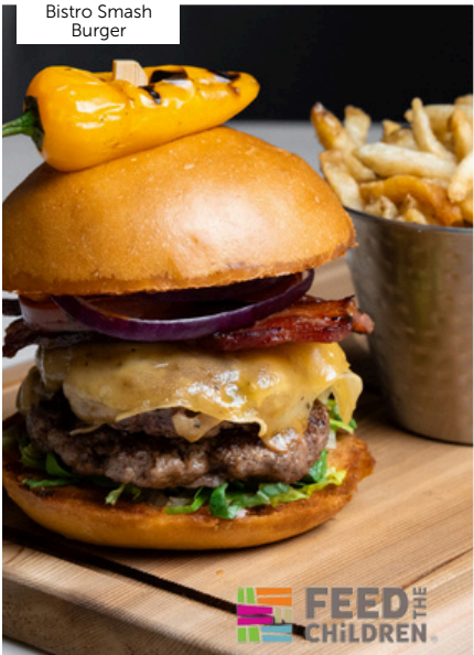
Bistro Smash Burger