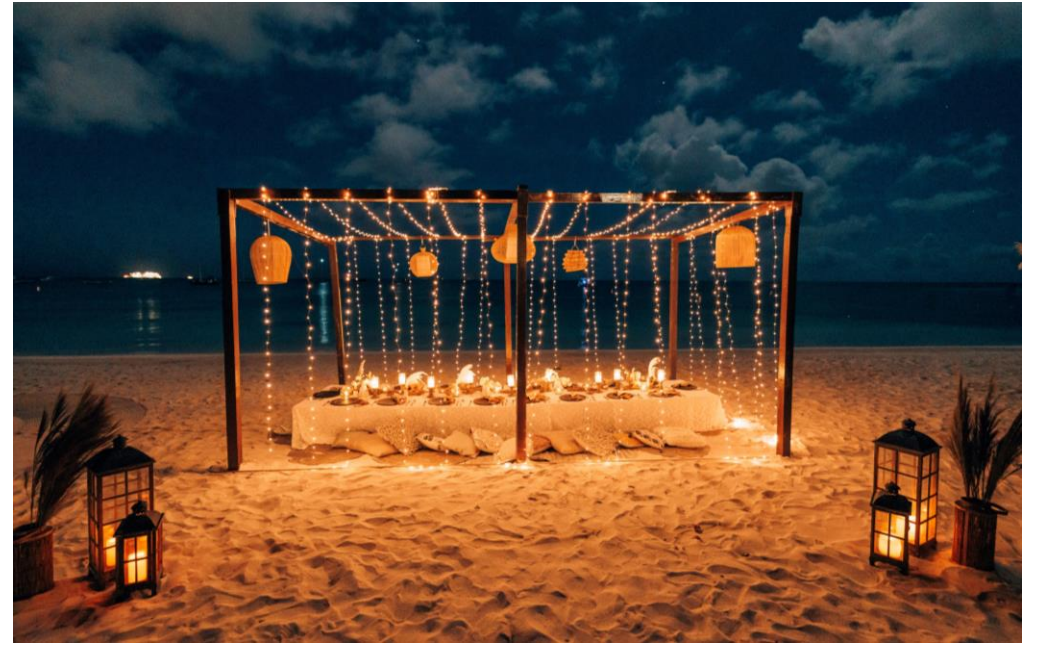
*Bohemian Picnic Setup