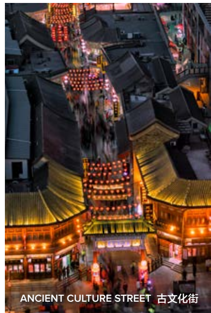
ANCIENT CULTURE STREET 古文化街