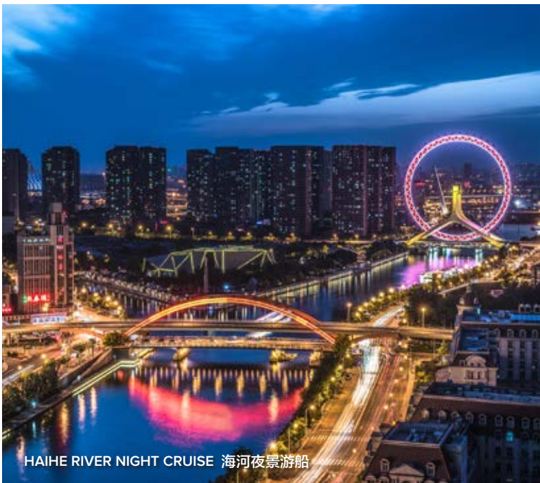
HAIHE RIVER NIGHT CRUISE 海河夜景游船