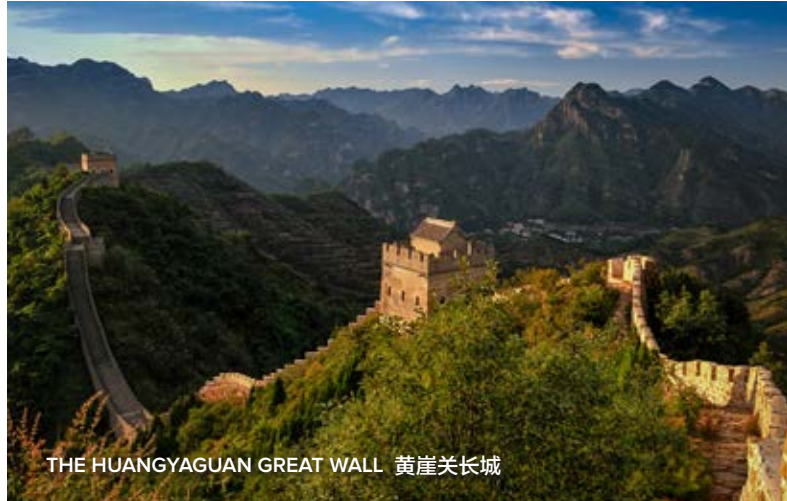
THE HUANGYAGUAN GREAT WALL 黄崖关长城