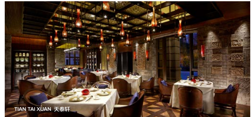
TIAN TAI XUAN 天泰轩