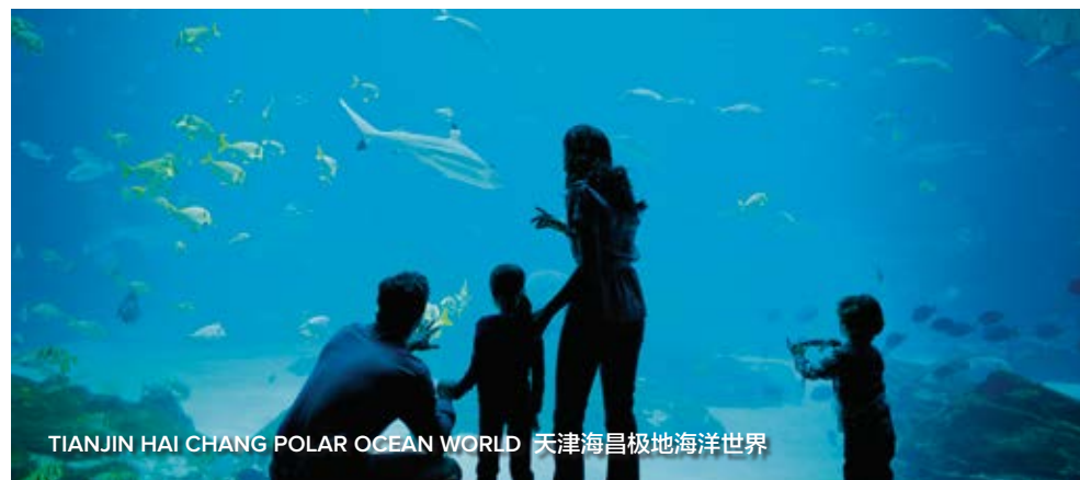
TIANJIN HAI CHANG POLAR OCEAN WORLD 天津海昌极地海洋世界

ADDRESS: No. 61 Xiangluo Business Area, Binhai New District, Tianjin, 45