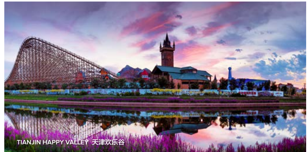
TIANJIN HAPPY VALLEY 天津欢乐谷

价格： 人民币 180 元 / 人，儿童票 (1.2m - 1.5m) 人民币 120 元 / 人