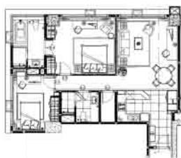
2 BEDROOM DELUXE SUITE 100 SQ.M