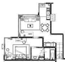
1 BEDROOM DELUXE SUITE 65 SQ.M