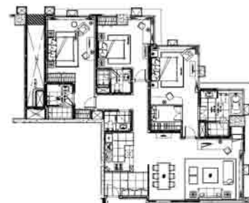
3 BEDROOM EXECUTIVE SUITE 165 SQ.M