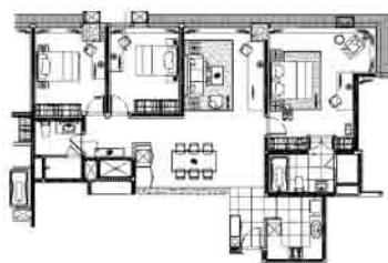
3 BEDROOM DELUXE SUITE 130 SQ.M