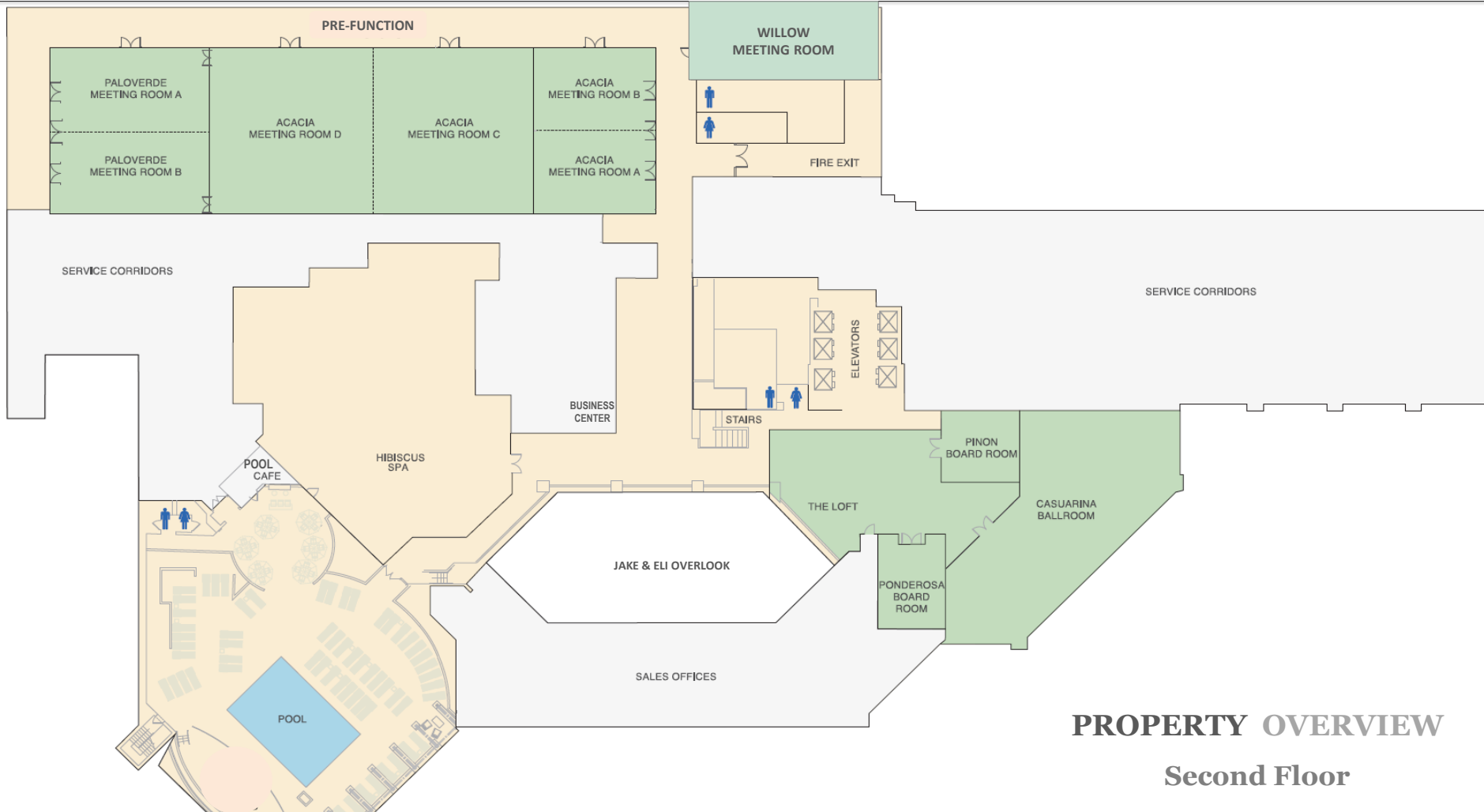
PROPERTY OVERVIEW Second Floor

160 E. Flamingo Rd, Las Vegas, NV 89109 | 702-836-5900