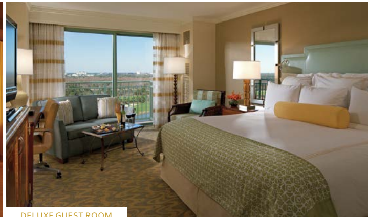
DELUXE GUEST ROOM