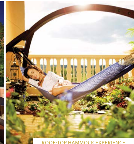
ROOF-TOP HAMMOCK EXPERIENCE