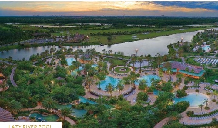
LAZY RIVER POOL