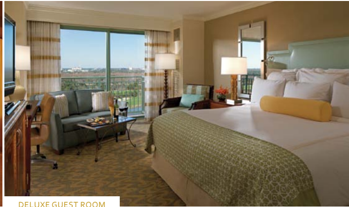
DELUXE GUEST ROOM