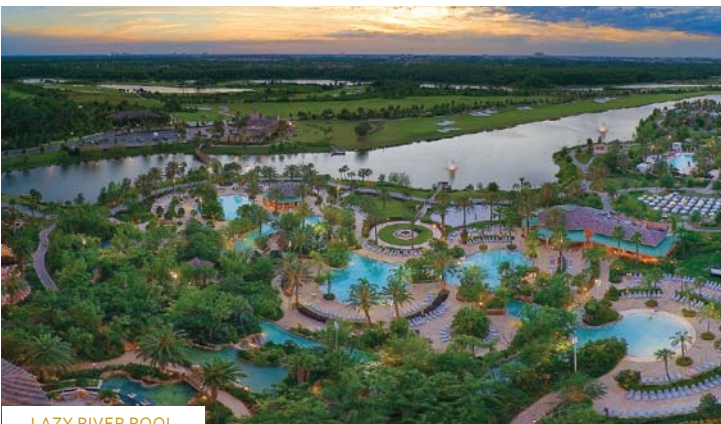
LAZY RIVER POOL