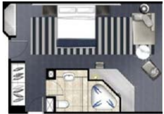
Ocean Room King