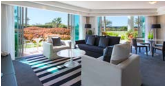
Garden Terrace Suite - Lounge