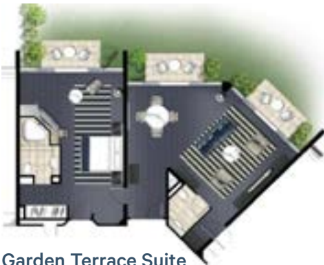
Garden Terrace Suite 115m 2