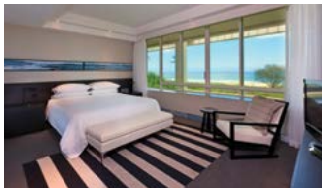
Presidential Suite - Bedroom