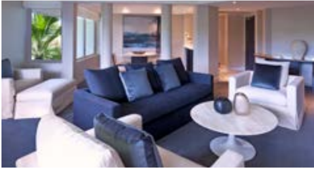
Mirage Suite - Lounge