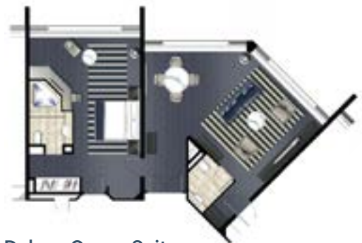
Deluxe Ocean Suite 97m 2

These luxurious and spacious suites feature an open plan living and dining area with a large separate bedroom. All suites are well appointed, with wide opening windows and views of the general resort lush gardens, or ocean, depending on the suite category selected. Both the 115m 2 Garden Terrace and 97m 2 Deluxe Ocean Suites feature a powder room off the living area. All suites can interconnect with a guest room providing a second bedroom option.