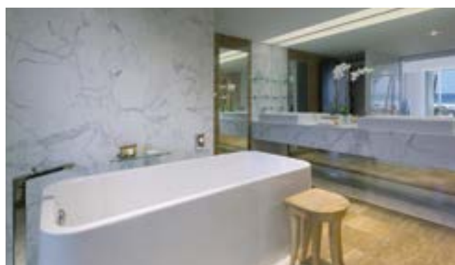
Presidential Suite - Bathroom