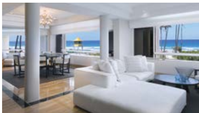
Presidential Suite - Lounge

The Presidential Suite is contemporarily designed in white, ivory and chocolate accents with marble floors and wide opening windows ensuring panoramic ocean views. An open plan living area features a 145cm LED TV, six seater dining, plush white sofa, chaise lounge and armchairs, and a dispense kitchen. The oversized bathroom has wall to ceiling glazing, and luxurious appointments including a plunge bath rain shower, dual vanities, bidet and toilet.