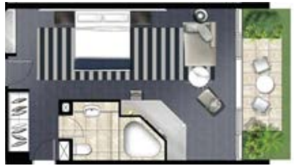
Garden Terrace King

Located on the ground floor, Garden Terrace rooms feature King or Double/Double beds. Relax on your private terrace and enjoy access to the lush gardens, direct from the comfort of your room.