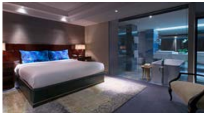
Royal Suite - Bedroom & Bathroom