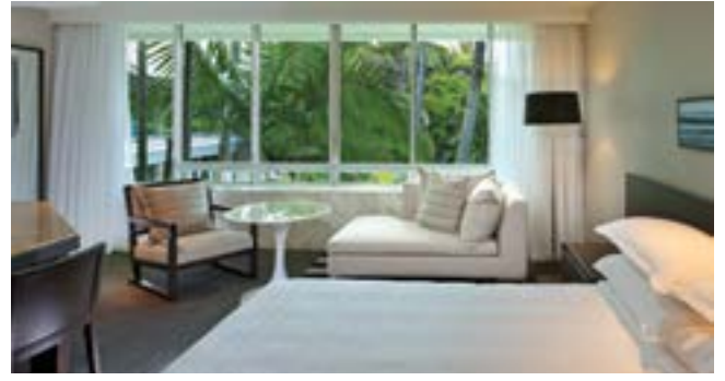
Mirage Suite - Bedroom