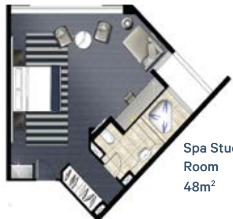
Spa Studio Room 48m 2