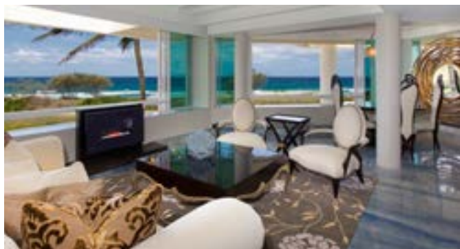
Royal Suite - Lounge

The Royal Suite is styled in luxury and sophistication to enhance its exclusive beachfront location with interiors featuring furniture from acclaimed designers Christopher Guy and Ralph Lauren. The suite is complete with a formal dining area, modern electronic fireplace, a 165cm LED TV and entertainment unit, and a butlers kitchen. The bathroom features luxurious appointments including a plunge bath, rain shower, dual vanities, bidet and toilet as well as wall to ceiling glazing to reveal ocean views through the bedroom's electronic curtains.