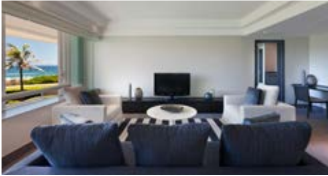
Ocean Suite - Lounge