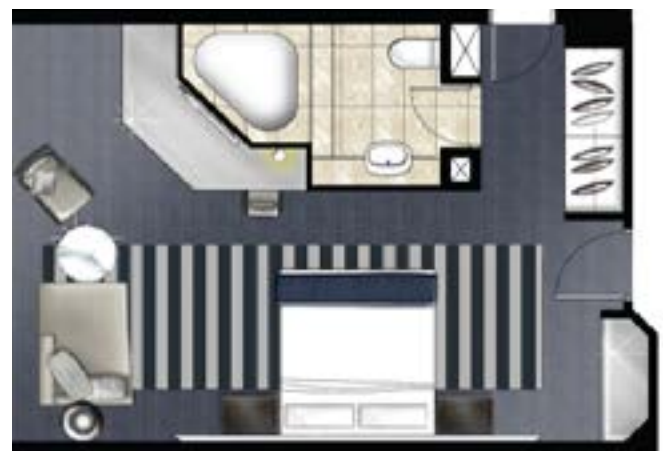
King 43m 2