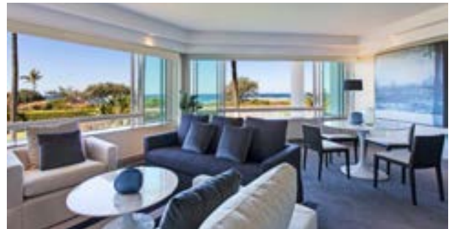
Deluxe Ocean Suite - Lounge