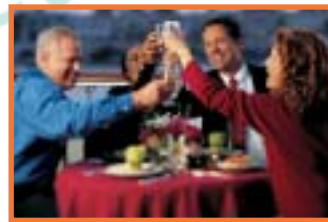
Enjoy dining aboard a Hornblower Cruise.

✦ Watch the fishing fleet come in along Jefferson Street. Over 300 boats call Fisherman's Wharf home. Pier 45 is the largest seafood processing area on the West Coast. San Francisco knows fish!