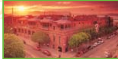
Sunset at The Cannery at Del Monte Square, once the world's largest peach cannery.

✦ The Cannery at Del Monte Square , the factory where they once canned Del Monte peaches is now a thriving marketplace. Spend a few hours in the delightful courtyard surrounded by shops and restaurants in an historic brick building.