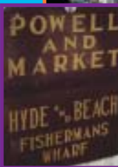
Cable cars replaced horses in 1869. It's all been uphill ever since.

Look for Cable Cars with this sign to get to Fisherman's Wharf.