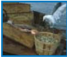
Salmon Capital of the West Coast—80% of all Salmon caught by sports fishermen comes from Northern California waters.

• Maritime National Historic Park. Visit one of the largest collections of historic maritime ships in the world. Ships and ship documents are on display at Hyde Street Pier.