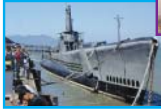
USS Pampanito is a WWII treasure at Pier 45, Fisherman's Wharf.

Square Rigged Balclutha at San Francisco Maritime National Historical Park.