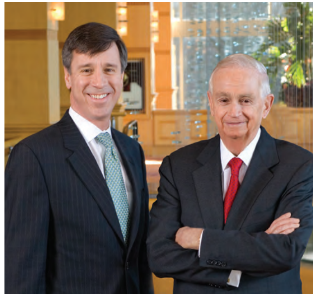
Arne M. Sorenson

We've prepared this report with an eye toward the three pillars of sustainability — economic, environment and social — to demonstrate how we do business, describe our commitments and show our progress. However, it is by no means all-inclusive of what our associates worldwide do at the local level.