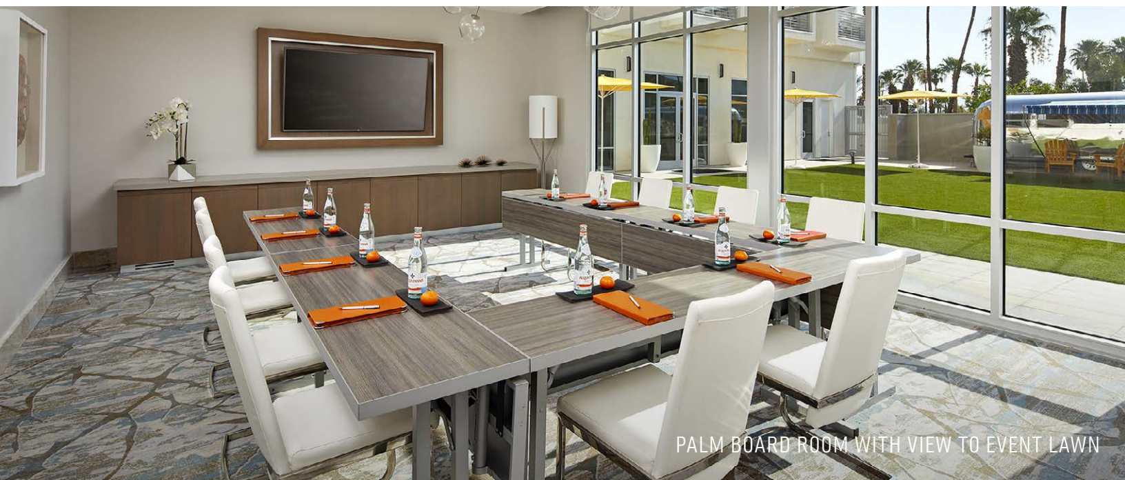
PALM BOARD ROOM WITH VIEW TO EVENT LAWN