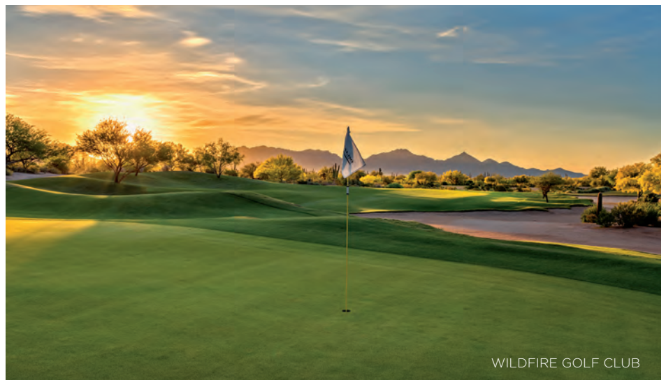
WILDFIRE GOLF CLUB

Enjoy resort amenities that provide the perfect balance between work and relaxation—36 holes of on-site championship golf, an award-winning spa and five outdoor pools, including the renowned Lazy River. You can elevate your event to an entirely new level with over 240,000 square feet of indoor and outdoor event space designed to educate the mind and stimulate the senses.